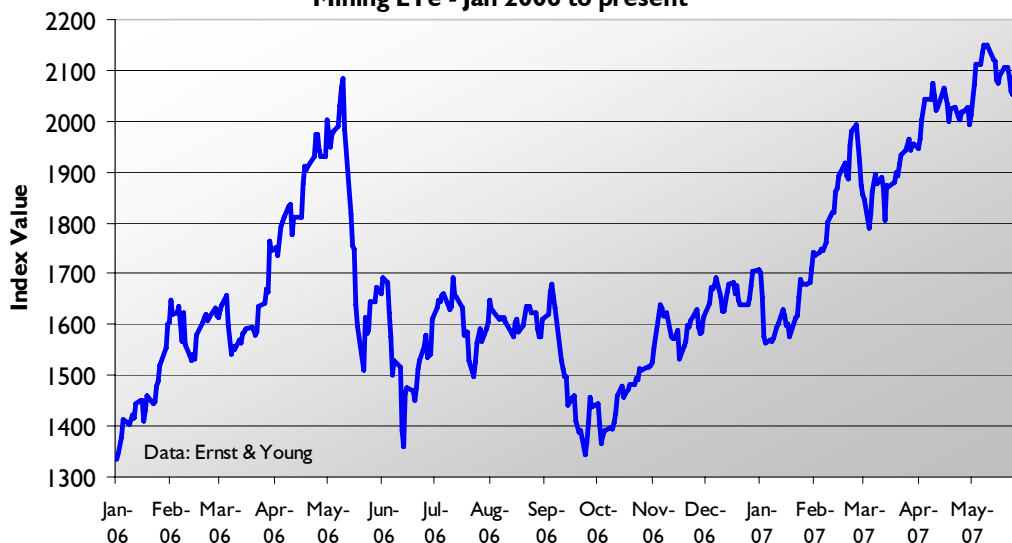
Mining EYe - Jan 2006 to present

Both the precious and base metals were hit hard towards the end of May. Fundamentals largely took a back seat as speculation forced metal prices lower and wiped out gains made over the last month. The fall in the Chinese equity market added further pressure to metal prices although long term we expect a return to fundamental drivers. Lead was the only metal to hold on to gains on the back of increased demand for car batteries. The start of the summer driving season in the US will see millions of Americans jump in their cars and drive a few hundred miles to visit a mall in another state. Gold is on the back foot and nickel is softening as LME stocks slowly increase to the highest level since July 2006.